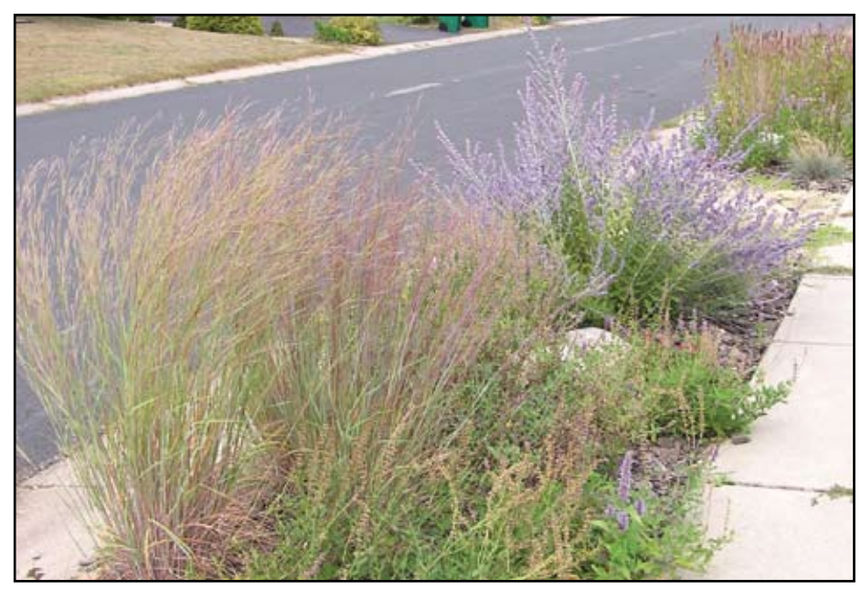
Boulevard Garden with prairie grasses