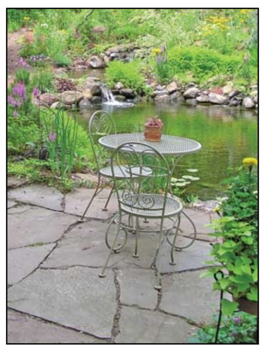
Patio adjacent to Pond