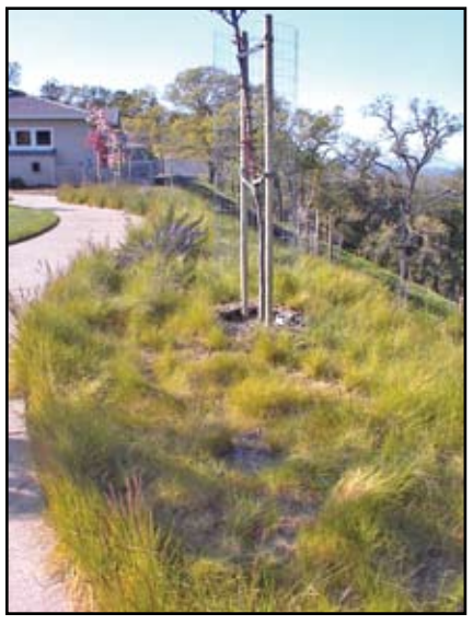
golden No-Mow Lawn