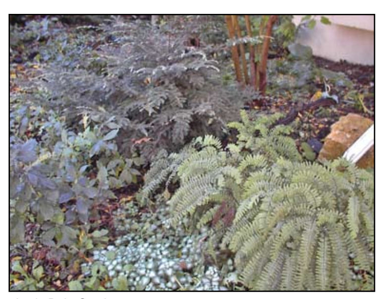
shady Rain Garden