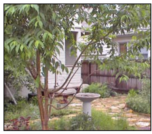
Patio with Island Beds